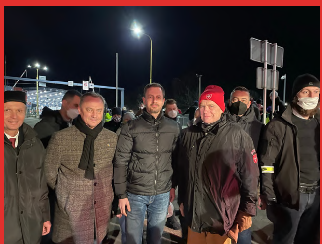
PHOTO: The Ambassador and the Slovak Prime Minister Eduard Heger at the border crossing in Vysne Nemecke