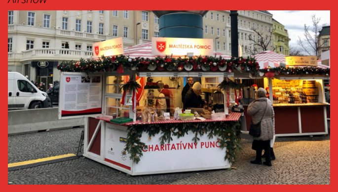
PHOTO: Malteser Charity Christmas Punch, Christmas Markets, Bratislava